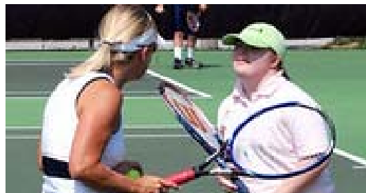
The above picture is from the 2007 Summer Games.

Tennis attire is appropriate. Bring your racquets in case you are one of the volunteers who will feed balls to the athletes.